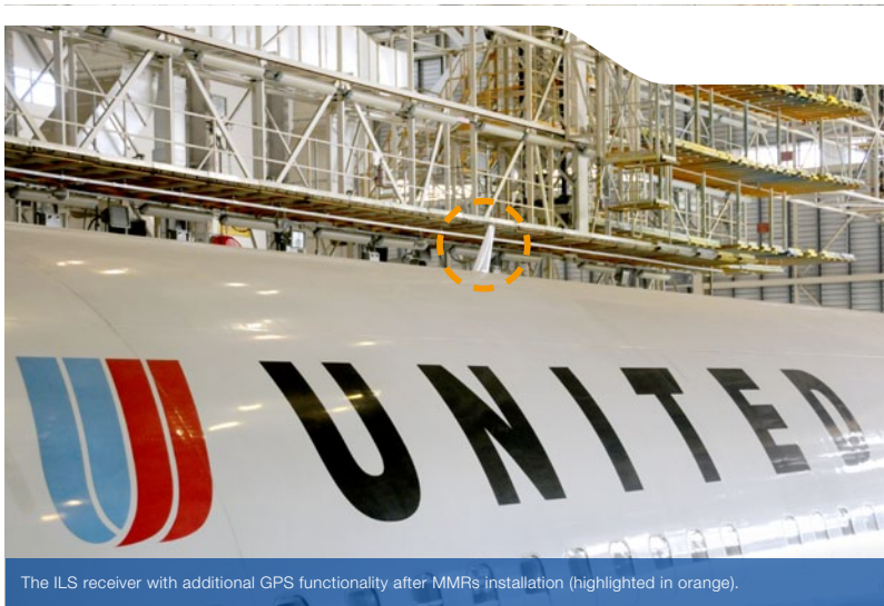
The ILS receiver with additional GPS functionality after MMRs installation (highlighted in orange).

HAECO commenced the programme to install FANS and MMRs on the Boeing 767-300 aircraft in the first quarter of 2013. 🏆